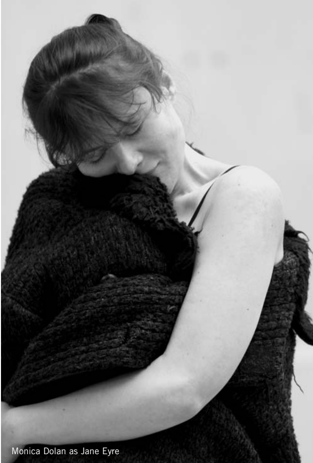
Monica Dolan as Jane Eyre

Today we no longer use the term 'Madness', but instead use 'mental illness'. Much medical and psychological study and improved general public teaching and awareness has done much to reduce the stigma and shame previously attached to mental illness. Today we place the illness firmly in the arena of health and not in the arena of social conditioning – or morality.