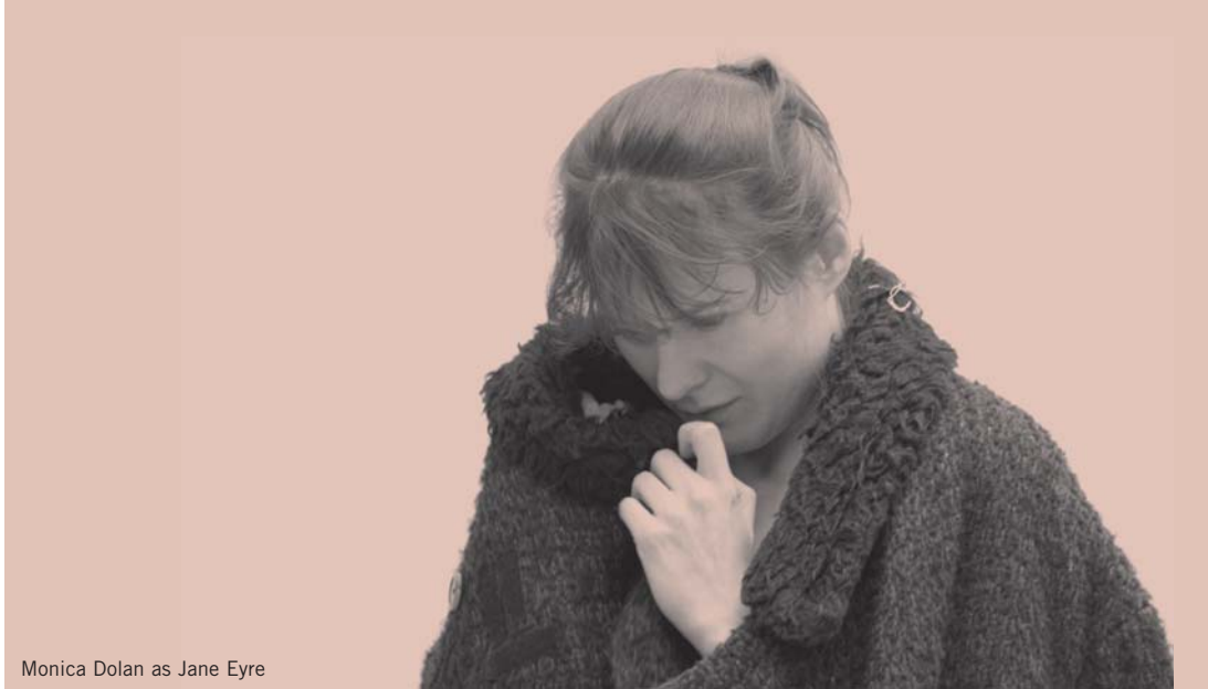
Monica Dolan as Jane Eyre

Returning to Jane Eyre fifteen years after I read it as a teenager I found, not the horror story I remembered, but a psychological drama of the most powerful kind. Everything and everyone in the story is seen, larger than life, through the magnifying glass of Jane's psyche.